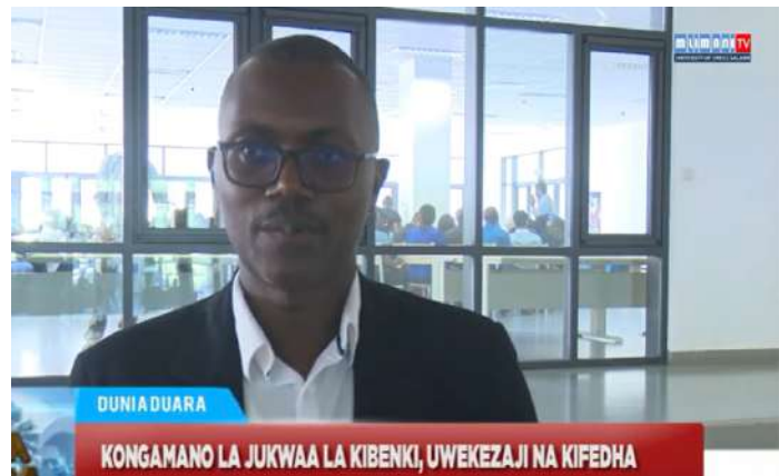
Head of Department of Finance - Briefing the Media on the First BFI